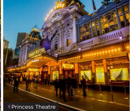
📍 Princess Theatre