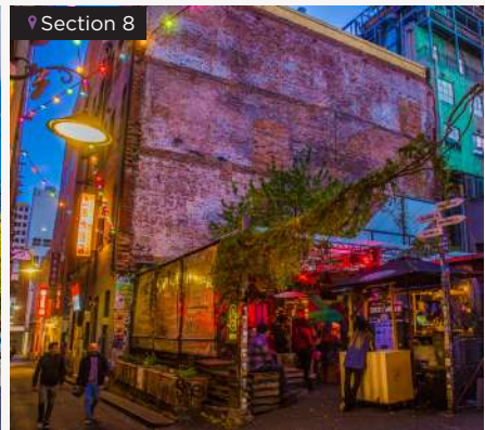
📍 Section 8

Facebook: /WhatsOnMelb Instagram: @WhatsOnMelb City of Melbourne: CityofMelb Hashtag: #MelbMoment