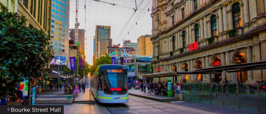
📍 Bourke Street Mall