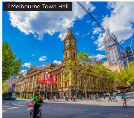
📍 Melbourne Town Hall