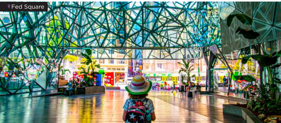
📍 Fed Square